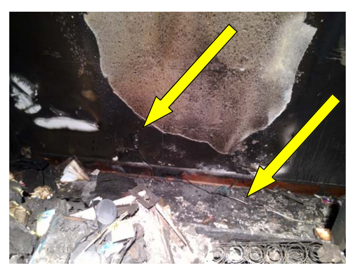
March 27th - Occupants returned and when they opened the outside door to their home, smelled smoke. They immediately moved away from the house and called 9-1-1 .

Firefighters entered the home and discovered that a fire had occurred in a bedroom. The fire had extinguished itself when it ran out of oxygen to sustain combustion. The bedroom walls were lath and plaster - found in many older homes. The plaster thickness provided for a higher level of fire resistance which also limited the spread of the fire.